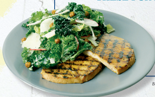
Butterball Grilled Turkey Breast with Spring Kale Caesar

Source: Technomic Healthy Eating Consumer Trend Report, 2022